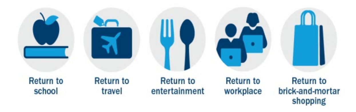
Figure 2: Tracking inputs

Our index suggests we're still 20% below pre-Covid activity levels. The levels of component activity vary: the return to brick-and-mortar stores is 13% below its pre-Covid levels and a normal work routine is 19% below pre-Covid. Travel and entertainment activity has recently had a stronger recovery, but it continues to lag other categories at 23% below pre-Covid levels. The return to school data may not see a meaningful gain until the fall – as long as a return to in-person schooling is more widely implemented.